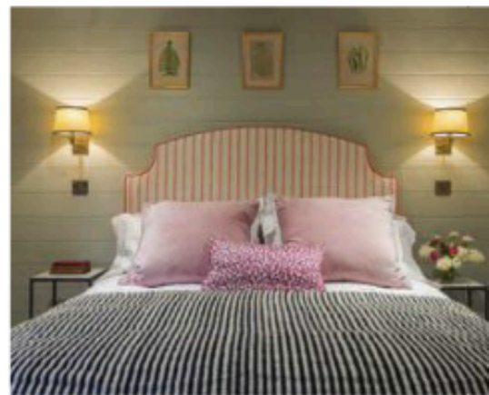
TOP: The master bedroom LEFT: The weather-boarded exterior, with a terrace leading out on to the garden BOTTOM LEFT: The stylish and well-equipped kitchen